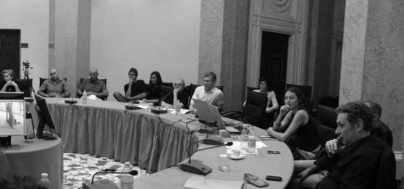
Forum's hall in Trieste