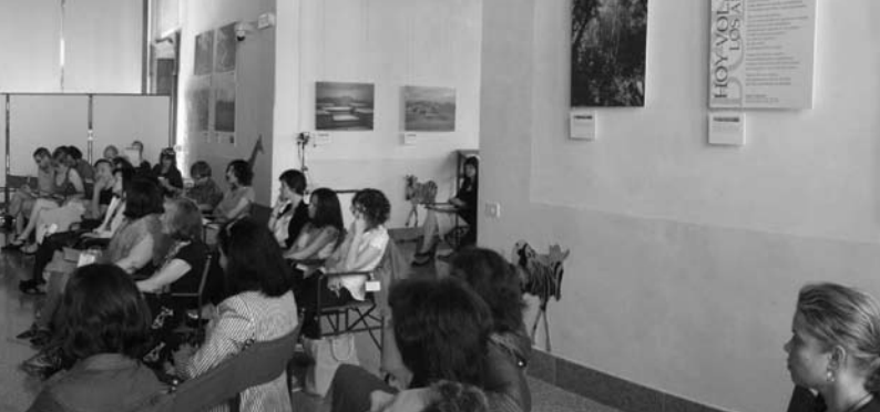
Forum's hall in Venice, previous and present page